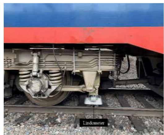
Figure 1 Differential eddy current measurement system (Lindometer) mounted on a freight train

The purpose of this project was to facilitate the development of an automated method for fastener inspection that can be carried out using vehicle-mounted measuring equipment operating in regular traffic.