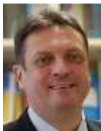
Michael Beer Chair